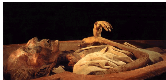
Fig. 11: The Mummy of Ramesses II (c. 1279- 1212 BC), Pharaoh of Moses, in the Egyptian Museum, Cairo