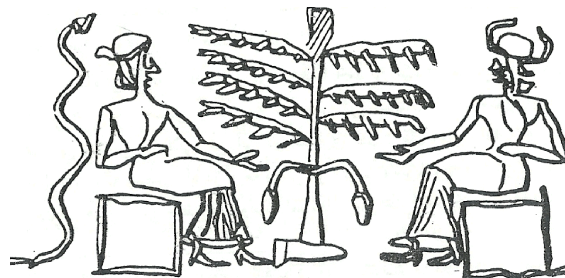
Fig. 10: Sumerian cylinder seal shows Adam and Hawwa and snake behind Hawwa

From archaeological point of view the story is depicted on one of the Sumerian cylinder seal that shown the serpent standing behind Eve and whispered her to eat- the tree in cylinder seal look like date palm tree- then she Hawwa' started encouraging Adam to eat from that tree. It seems to me that the story of Adam and Hawwa was transfer from one generation to another until reach to Sumerian in the third millennium BCE (Fig. 10).