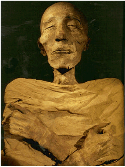
Fig. 12: Mummy of Merneptah (ca.1212 -1202 BCE), Exodus Pharaoh

Moses' Pharaoh's and Mummification [39] (Archaeological and Islamic Sources): Among the many hypotheses, concerning the historical time-frame occupied by the Exodus in the history of the pharaohs, I have concluded that the most likely is the theory which makes Merneptah [40], Ramesses II's [41] successor, the pharaoh of the Exodus. The comparison of the data contained in the Scriptures with archeological evidence strongly supports this hypothesis. I am pleased to be able to say that the Biblical narration contributes weighty evidence leading us to place Moses in the history of the pharaohs. Moses was probably born during the reign of Ramesses II. (Fig. 11) Biblical data are therefore of considerable historical value in the story of Moses. A medical study of the mummy of Merneptah (Fig. 12) has yielded further useful information on the possible causes of this pharaoh's death [42, 43]. The fact that we possess the mummy of this pharaoh is one of paramount importance. The Bible records that pharaoh was engulfed in the sea, but does not give any details as to what subsequently became of his corpse. The Qur'an, in Surah Yunus notes that the body of the pharaoh would be saved from the waters: "Today I will save your dead body so that you may be a sign for those who come after you" [44].