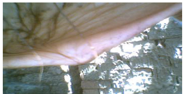
Fig. 2. Buffalo showing skin lesion.