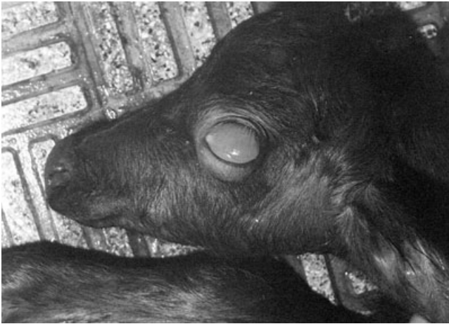
Fig. 1. Gross appearance of dermoid cyst occupied the left orbit of the presented buffalo calf. The mass entirely covers the intraocular structures.